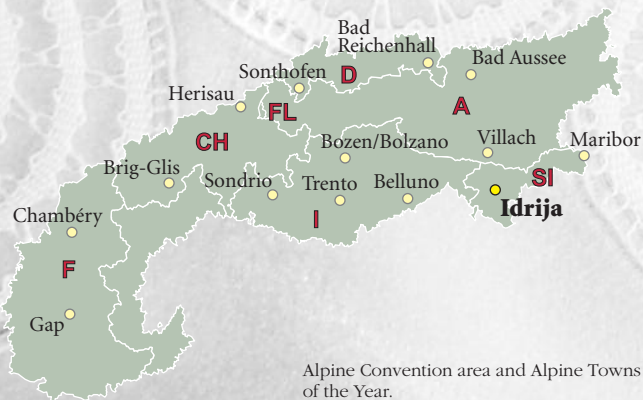
Alpine Convention area and Alpine Towns of the Year.

To achieve these objectives, the participating countries are joining various Alpine networks; one such network is the Alpine Town of the Year association, linking towns designated Alpine Town of the Year since 1997. This prestigious title is awarded by an international jury of representatives of the Network of municipalities Alliance in the Alps, International Commission for the Protection of the Alps (CIPRA), and Pro Vita Alpina organization to a town implementing sustainable development and successfully coordinating ecological, economic, social, and cultural objectives. Together with Idrija fourteen Alpine towns have received this title so far.